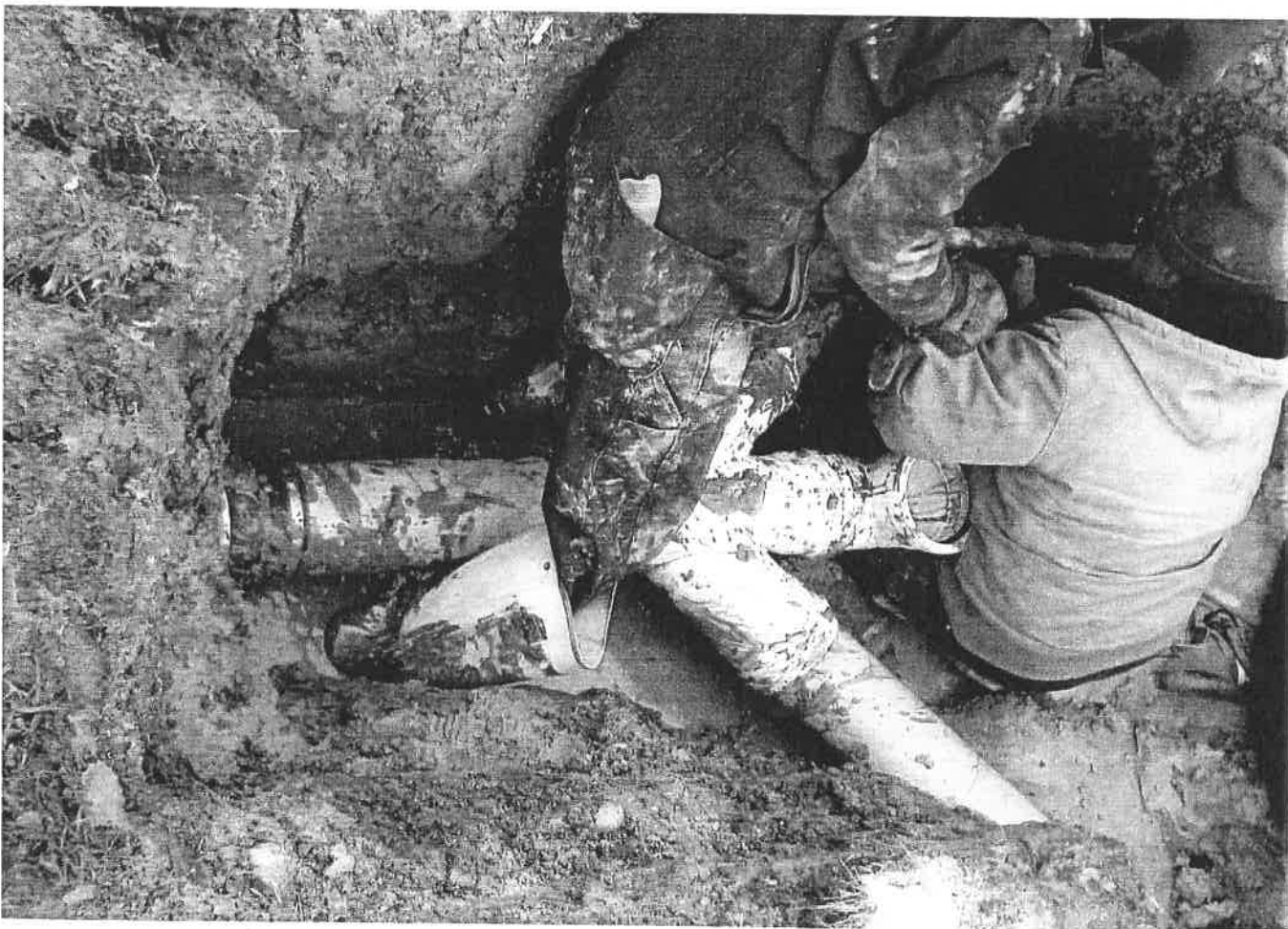
145 & 155 Northeast Dr.