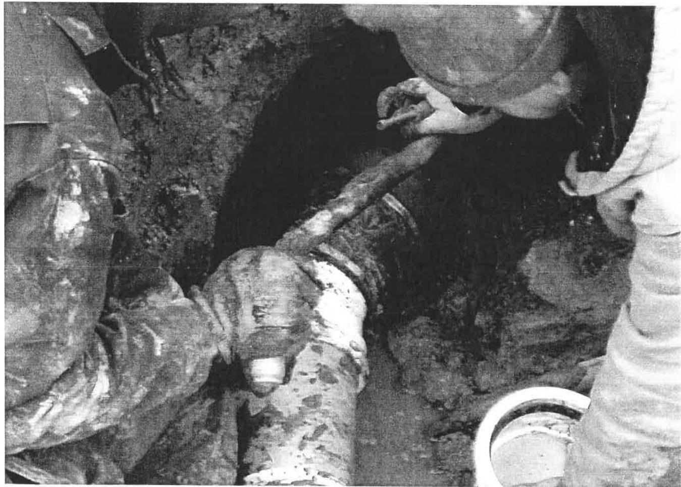
145 & 155 Northeast Dr.